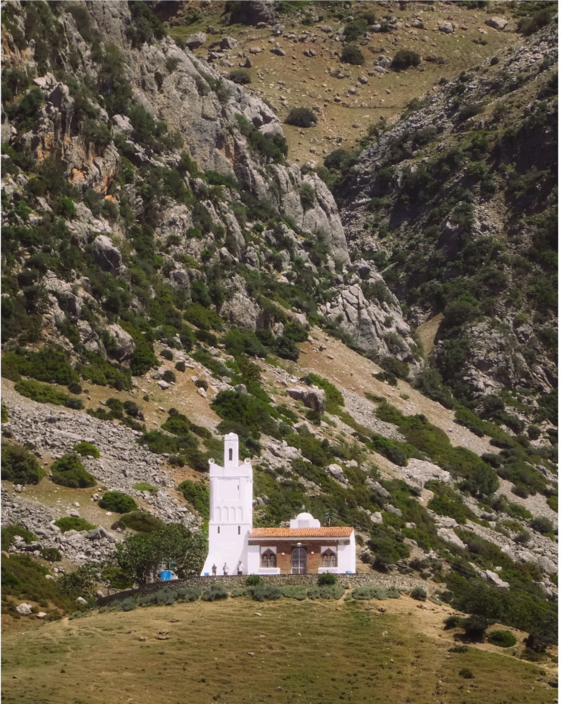
Spanish Masjid, Chefchaouen, Morocco.