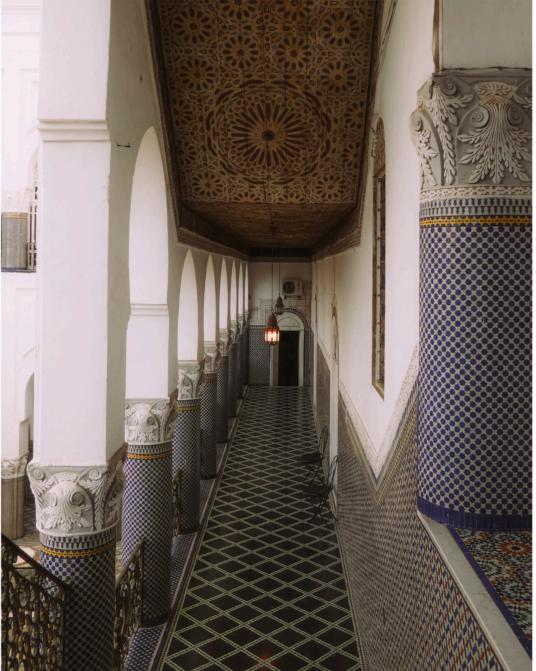
Palais El Mokri, Fez, Morocco.