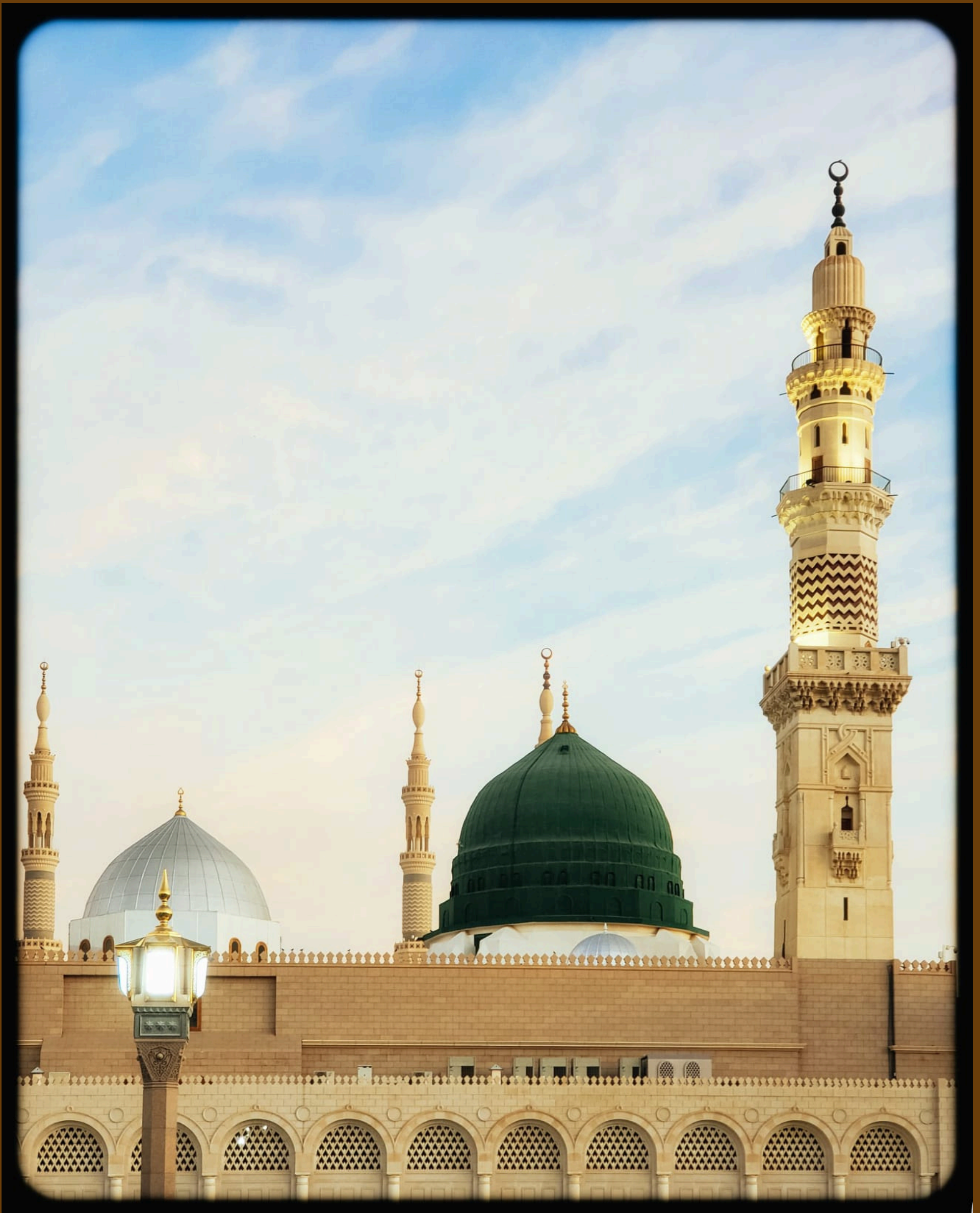
Masjid an Nabawi